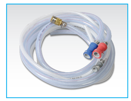
20' Hose Kit